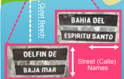
Casa De la Pescada Blanca (en Playacar Fase I)